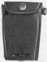
with Leather Eveready Case